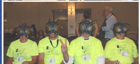
Pictured above: Team Winner for Best Costumes—Craig & Fox, PLLC.; Team Winner for Best Cheering Section: Hogue Hill Hornets.