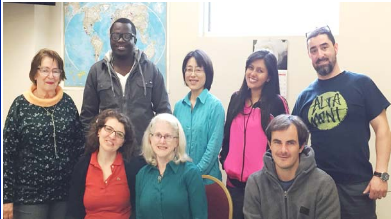
Morning Advanced ESL Class, pictured above