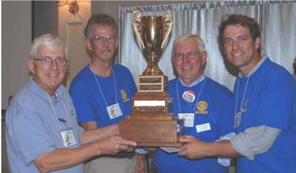
Spelling Bee 2016 Champions and Team Winner for Best Team Name: The Wilmington Rotary Club, "Spells Like Teen Spirit."